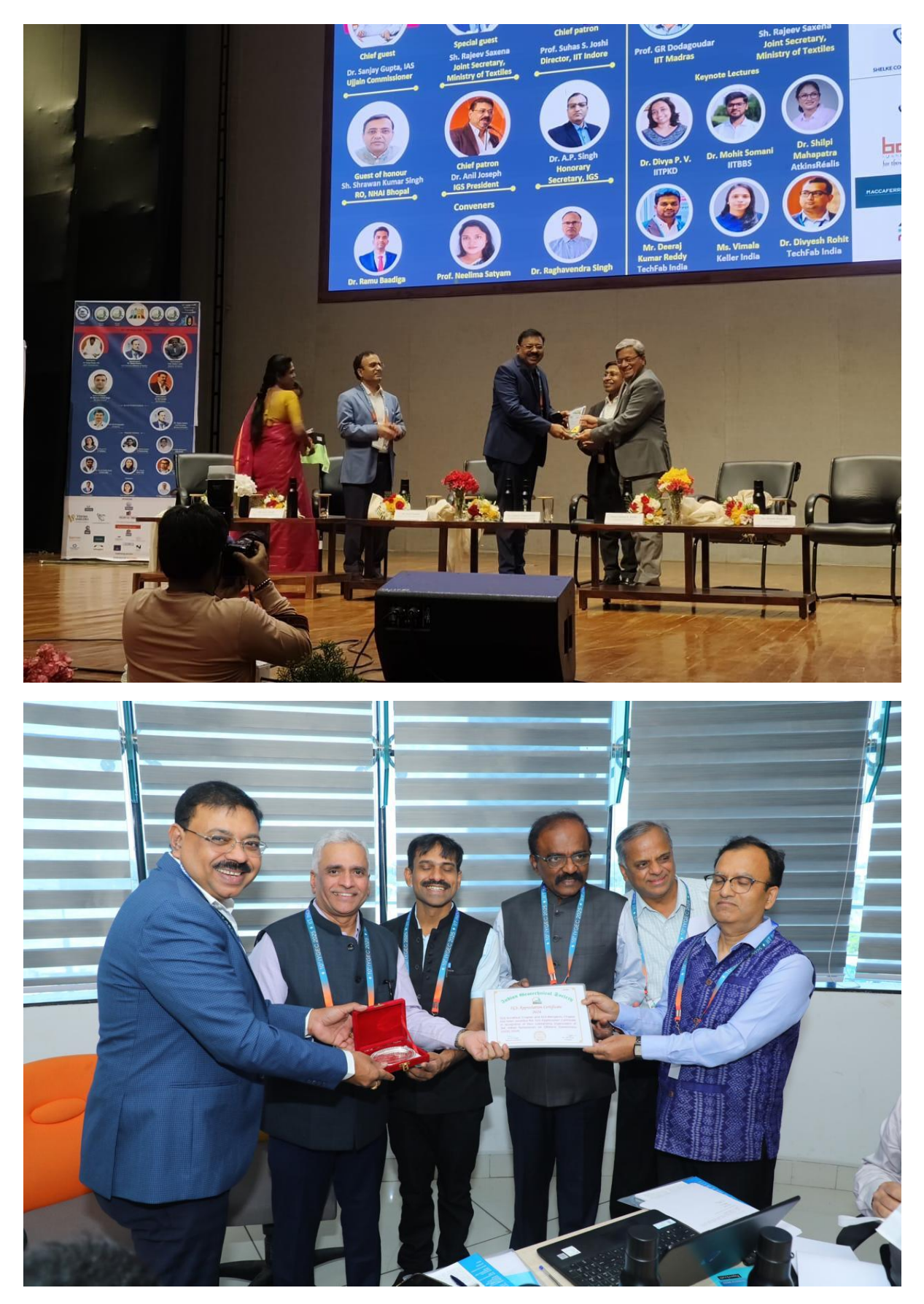
Got the opportunity to attend the inaugural day of the 2<sup>nd</sup> International Conference on Civil Engineering Innovative Development in Engineering Advances (ICC IDEA 2025) at SRM Institute of Science and